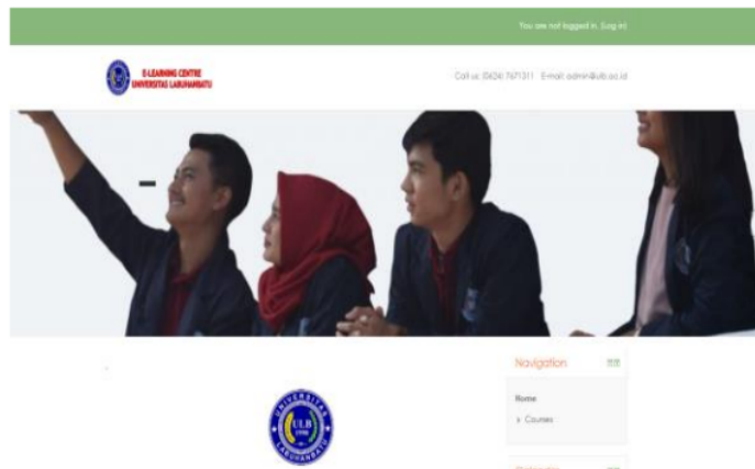
Fig 1:- Home e-learning ULB

Some faculty regard the process of learning e_learning applied by the campus of the University of labuhan batu